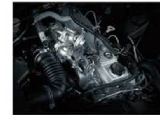
4M40 2800cc SOHC engine

Mitsubishi Strada Triton Double Cab HDX, penerus tradisi ketangguhan Mitsubishi Strada yang telah teruji. Mesin diesel 2,8 L dan sistem penggerak 4 WD yang tangguh menjadikannya partner penjelajahan di area pertambangan.