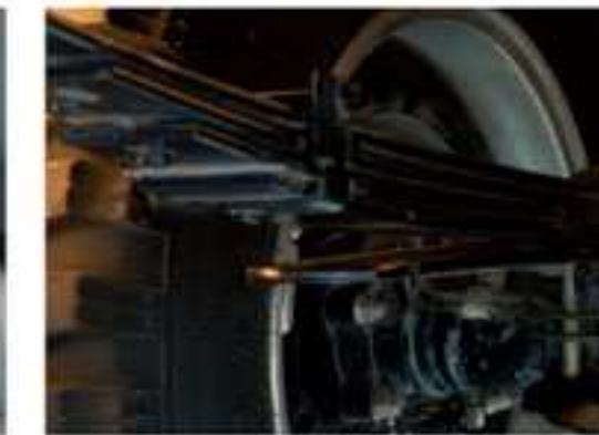
Strong & Stable Suspension