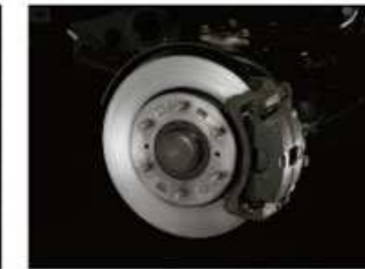
Ventilated Disc 16" Brake