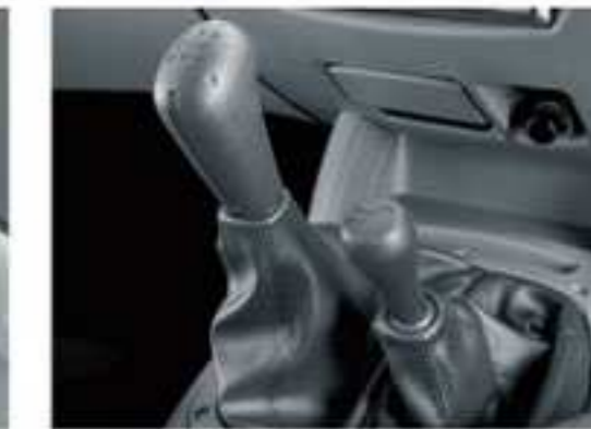
Easy Select 4WD