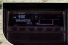
Multi mode meter