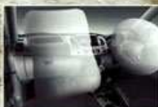
Dual SRS Airbag (GLS AB)