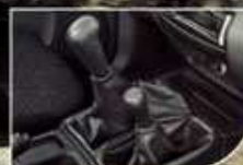
Easy Select 4WD