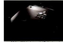
2.5-liter 16 Valve Intercooled Turbocharged DOHC Commonrail G1-D