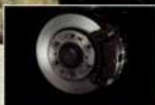
Ventilated Disc 16" Brake