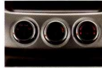
Auto Air Conditioner