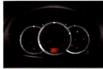
Ambient Illumination Meter

Mitsubishi Strada Triton GLS & GLS AB, kendaraan double cabin yang tangguh di segala medan, namun tetap nyaman dikendarai. Mesin bertenaga besarnya tetap irit karena menggunakan teknologi commonrail yang efisien.